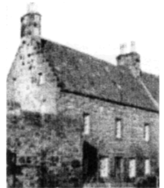
The Preservation Trust's showpiece Museum in North Street

CAN YOU HELP? We need 3 or 4 upright dining table type chairs for the museum. Please contact 01334 477629