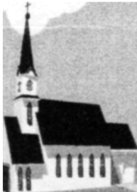
The Scottish Redundant Churches Trust

* We have vacated our old office for smart new premises just across the corridor in Queen's Gardens. Our previous office is now occupied by The Scottish Redundant Churches Trust , a charitable trust founded in 1996 and funded principally by Historic Scotland with the aim of acquiring and conserving redundant historic places of worship of all denominations in Scotland. They currently own four churches in Orkney, Ross-shire, Perthshire and Lanarkshire.