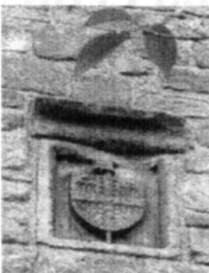
Carved stone at The Roundel

The building is generally in reasonable condition with only a rooftop valley gutter which, in common with many others of this design, has proved problematical with resultant water leakage. Some settlement of the structure to the rear of the building has also been noted and will be part of the remedial works to be carried out. Alterations will incorporate facilities for disabled students.